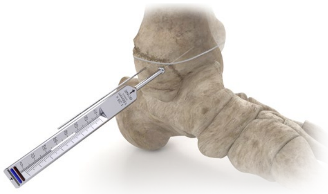
Figure 5: Direct Measurement Device