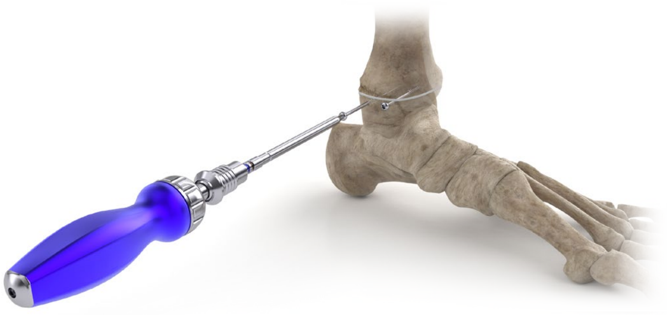
Figure 8: Insert screw with driver