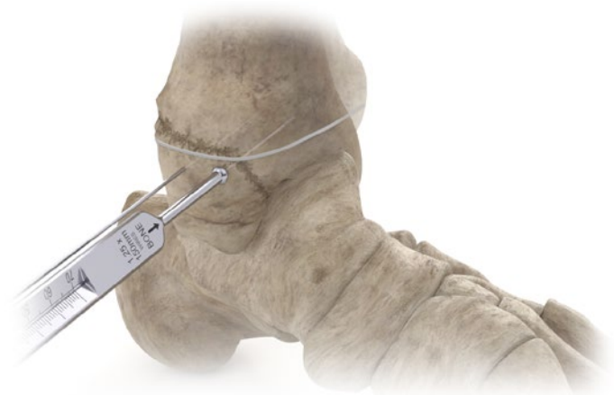
Figure 6: Measure from side of device labeled 'BONE'