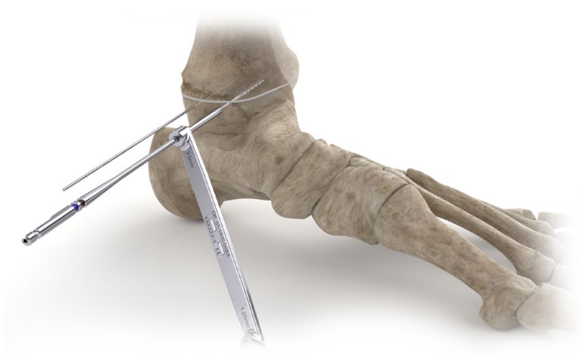
Figure 7: Drill over wire